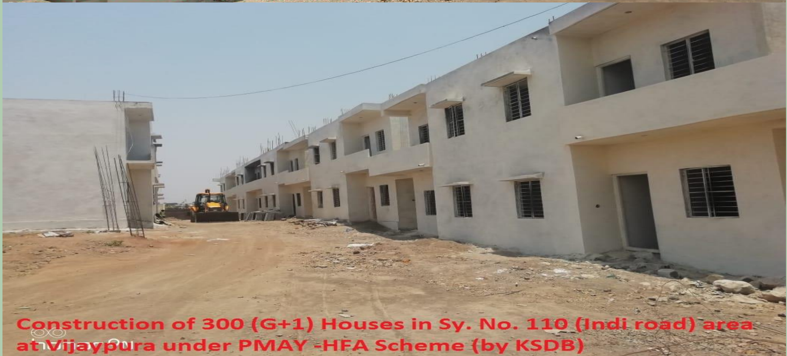
Construction of 300 (G+1) Houses in Sy. No. 110 (Indi road) area at Vijayapura under PMAY -HFA Scheme (by KSDB)