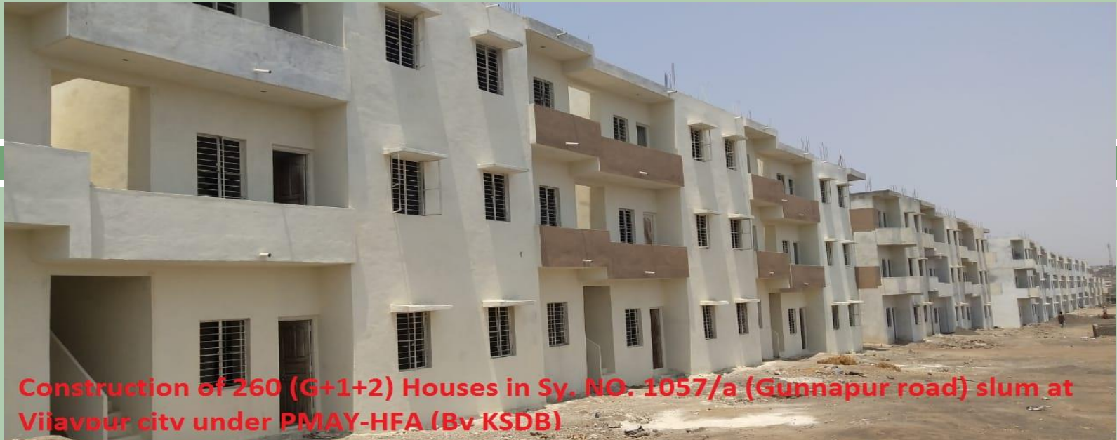
Construction of 260 (G+1+2) Houses in Sy. NO. 1057/a (Gunnapur road) slum at Vijayapura city under PMAY-HFA (By KSDB)